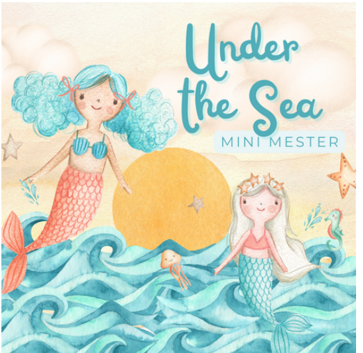
Under the Sea: Jazz/Tumbling Session 4: Feb 22-March 22 5 Weeks for $55 Every Saturday, 11:00-11:30 AM

Nutcracker: Ballet Session 2: Nov 2-Dec 14 (skip Thanksgiving week) Every Saturday, 11:00-11:30 AM