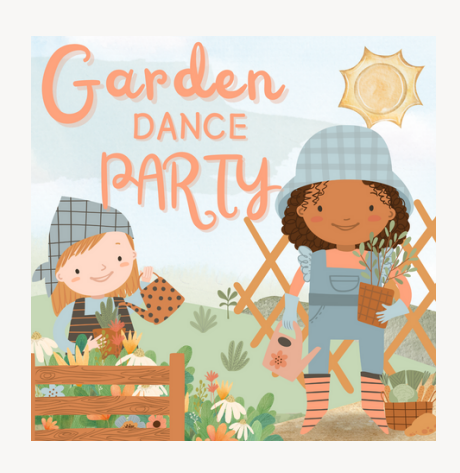
Garden Party Style: Ballet July 22 Ages 3-4: 10 am- 12 pm Ages 5-7: 10am-12 pm