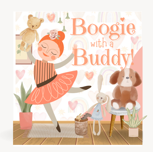
Boogie With a Buddy Style: Ballet/Jazz August 12 Ages 3-4: 10 am- 12 pm Ages 5-7: 10am-12 pm Bring a stuffed animal or doll to dance with!